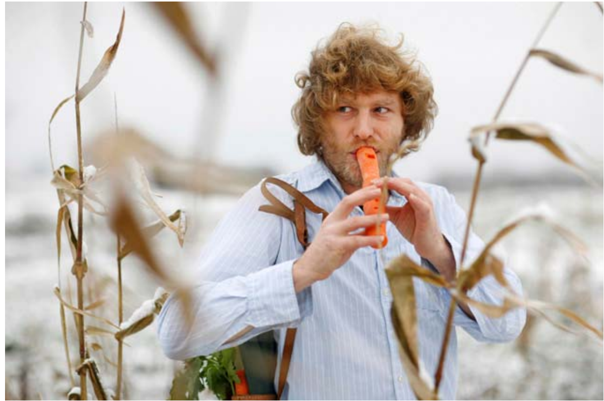
Télérama - décember2008

Every year, the poly sensorial immersions get richer from the birth of new tools and projects.