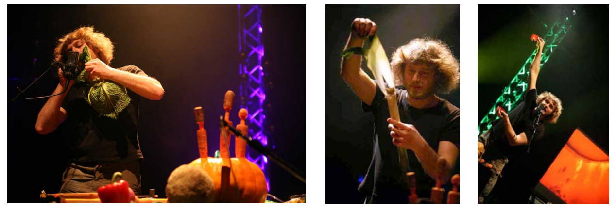
Concert & Meeting at the 'Roulements de Tambour' student festival in Rennes 2009