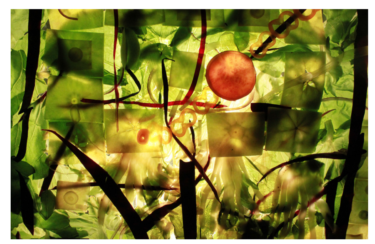
2010 : Orgabits news